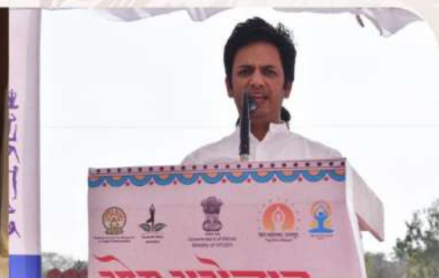
Felicitation by Ministry of AYUSH GOI