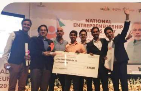
National Entrepreneurship Award for best Startup by GOI