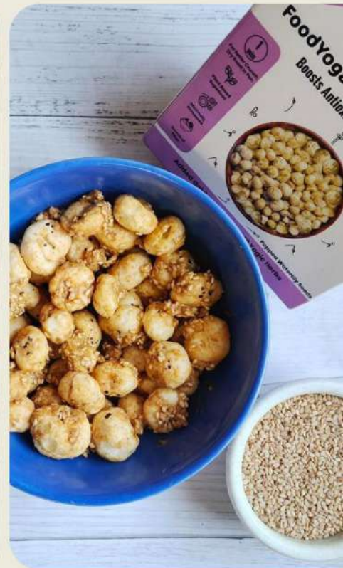
Offices And MNCs