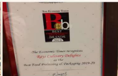
Awarded Best Wellness Brand of India by Economic Times